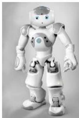
NAO humanoid robot